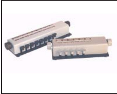
Part# DIF50, DIF80